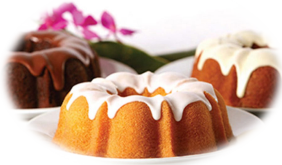
Edda's Cake Designs